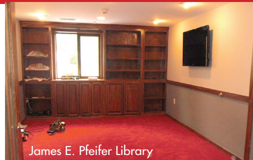
James E. Pfeifer Library